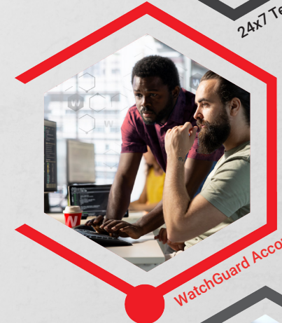
WatchGuard Account Reps