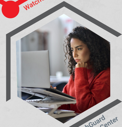
WatchGuard Learning Center